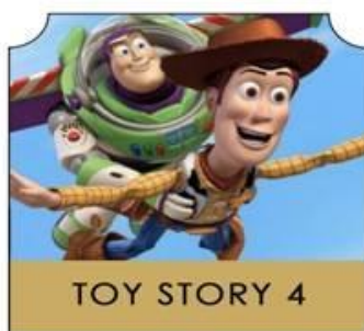
TOY STORY 4